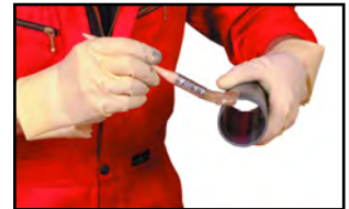
Brush applying cement to the pipe