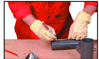
Marking the pipe end