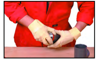
Chamfering the pipe