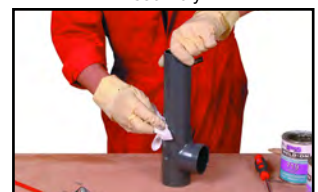
Wiping away excess cement