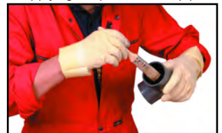
Brush applying cement to the fitting