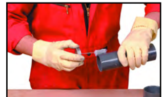
Applying the primer to the pipe