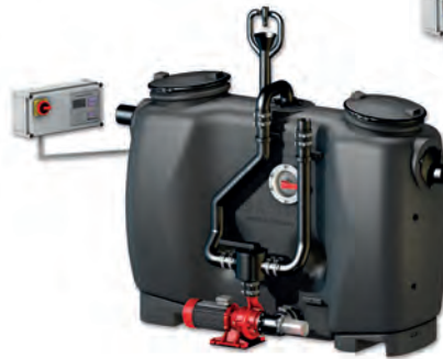
Easy Clean Mix and Pump