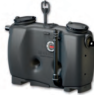
Easy Clean Basic and Standard