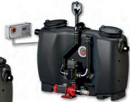
Easy Clean Auto Mix and Pump