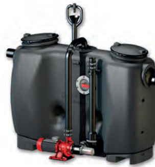
Easy Clean Mix and Auto Mix